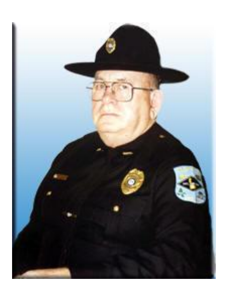
Chief Ward "Junior" Collins 1966 to 2001

Selbyville Police Department 68 W. Church St. Selbyville, DE 19975 302-436-5085 302-436-5299 fax